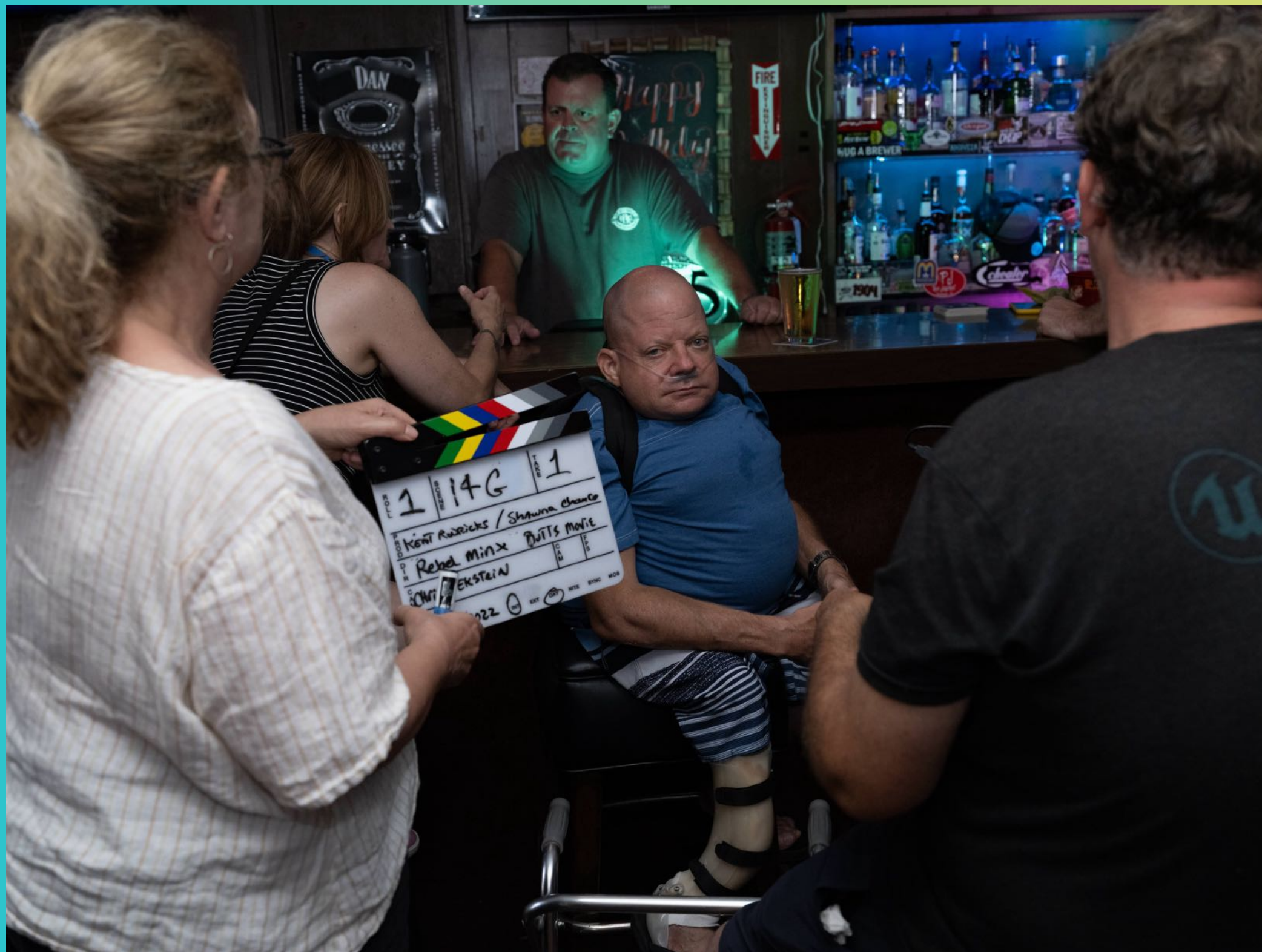
Kent on set "no ands ifs or butts we need to wrap this scene soon!"